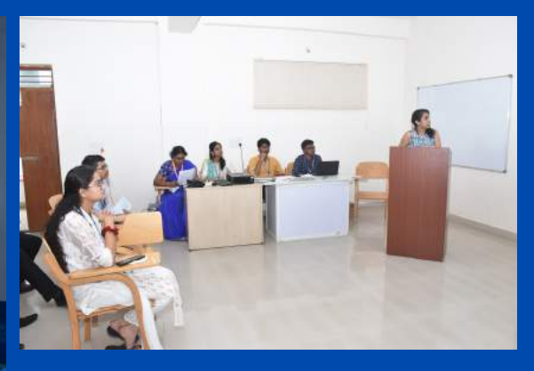
Pre Conference Workshop